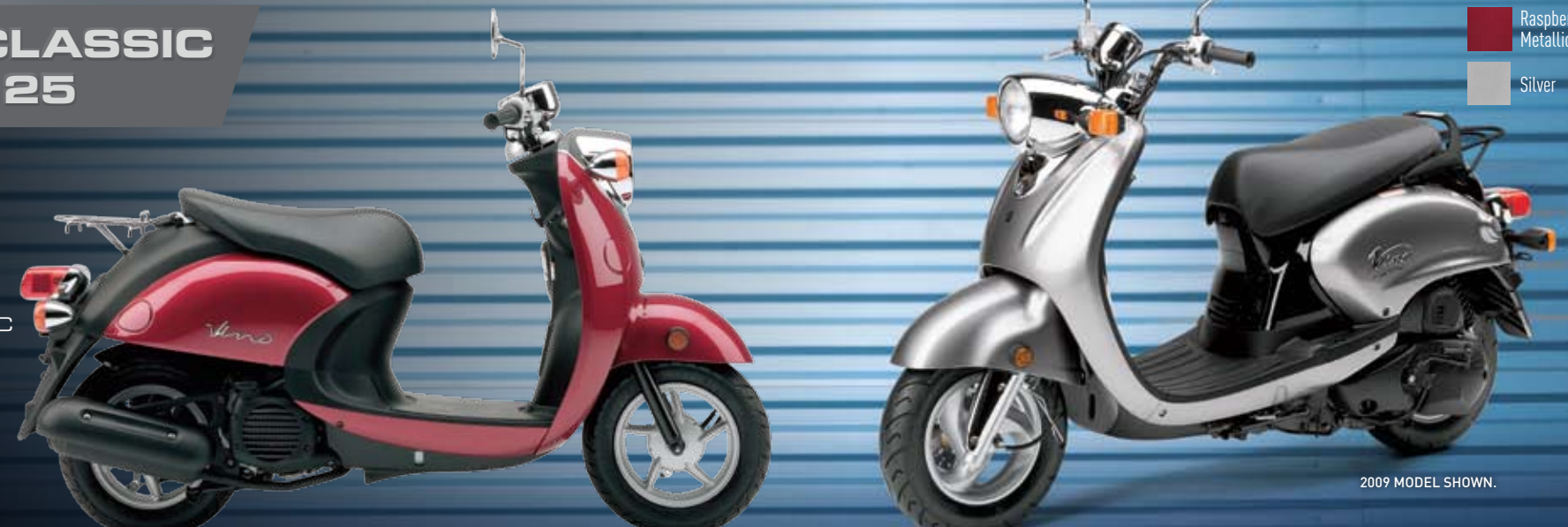
2009 MODEL SHOWN.