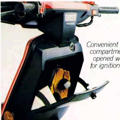
Convenient front locking storage compartment of the Aero 80 can be opened with the same key used for ignition and other locks.