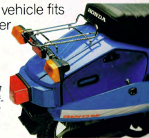
The Aero 50's locking side storage compartment can be opened with the ignition key.

The 50 is for you if a smaller vehicle fits your needs. Or if you have a smaller budget (the 50 is our most inexpensive Aero).