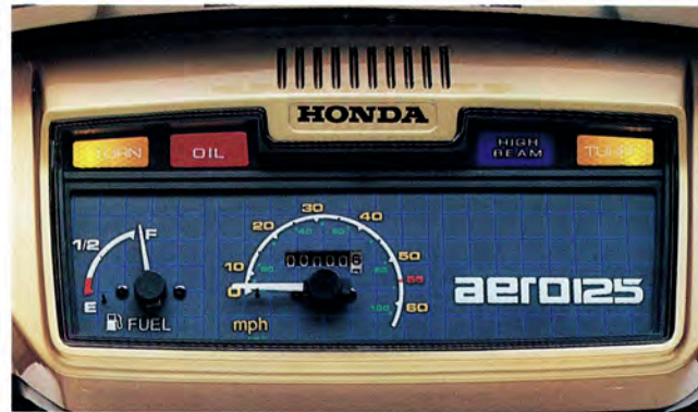
The Aero 125's full instrumentation includes speedometer, odometer, fuel gauge, and low-oil warning light.

The transmission is completely automatic. So's the choke. Starts at the push of a button. And there's automatic oil injection (so no pre-mixing oil and gas).