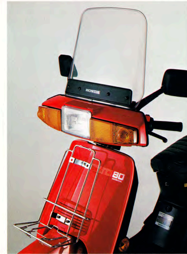
Optional equipment available for the Aero 80 include a handy front-mounted carrying rack and a windscreen.

Despite performance and features few similar machines can rival, the Aeros are avail-