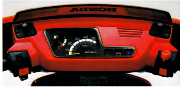
The Aero 80's easily read instrument panel includes speedometer/odometer, gas gauge, oil warning light, directional signal indicators and hi-beam indicator.

Both Honda Aeros have powerful, dependable two-stroke engines with forced air cooling. And both benefit from an advanced engine design engineered to achieve both excellent power output and superior fuel economy. Combined with Honda's V-matic* variable ratio transmission, they provide the kind of responsive power that gives you crisp acceleration and better performance on hills.