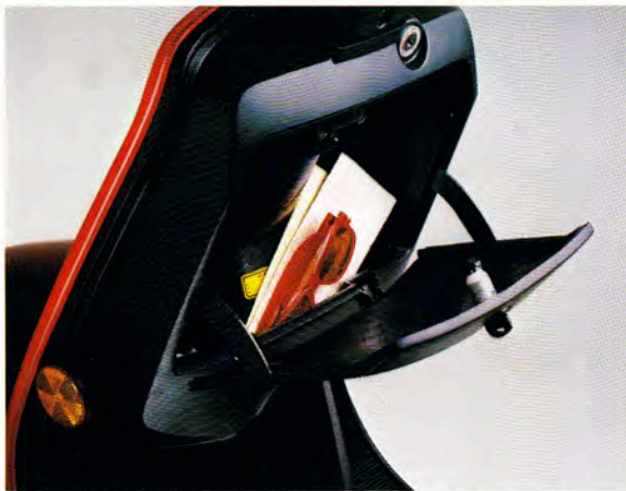
Convenient locking storage compartments of the Aero 80 can be opened with the same symmetrical key used for the ignition and other locks.

Starting is a snap. Both the Aero™ 50 and Aero™ 80+ have electric starting systems and automatic chokes. Just engage the rear brake, push the starter button and you're ready to go. It's quick, it's easy...and less complicated than some other systems.