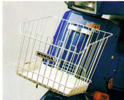
This useful, large capacity carrying basket is available as an option for the Aero 50.