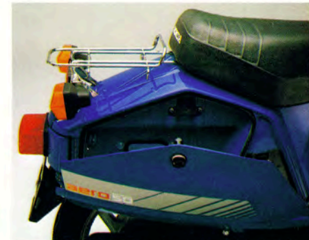
The Aero 50's locking storage compartment can be opened with the ignition key.