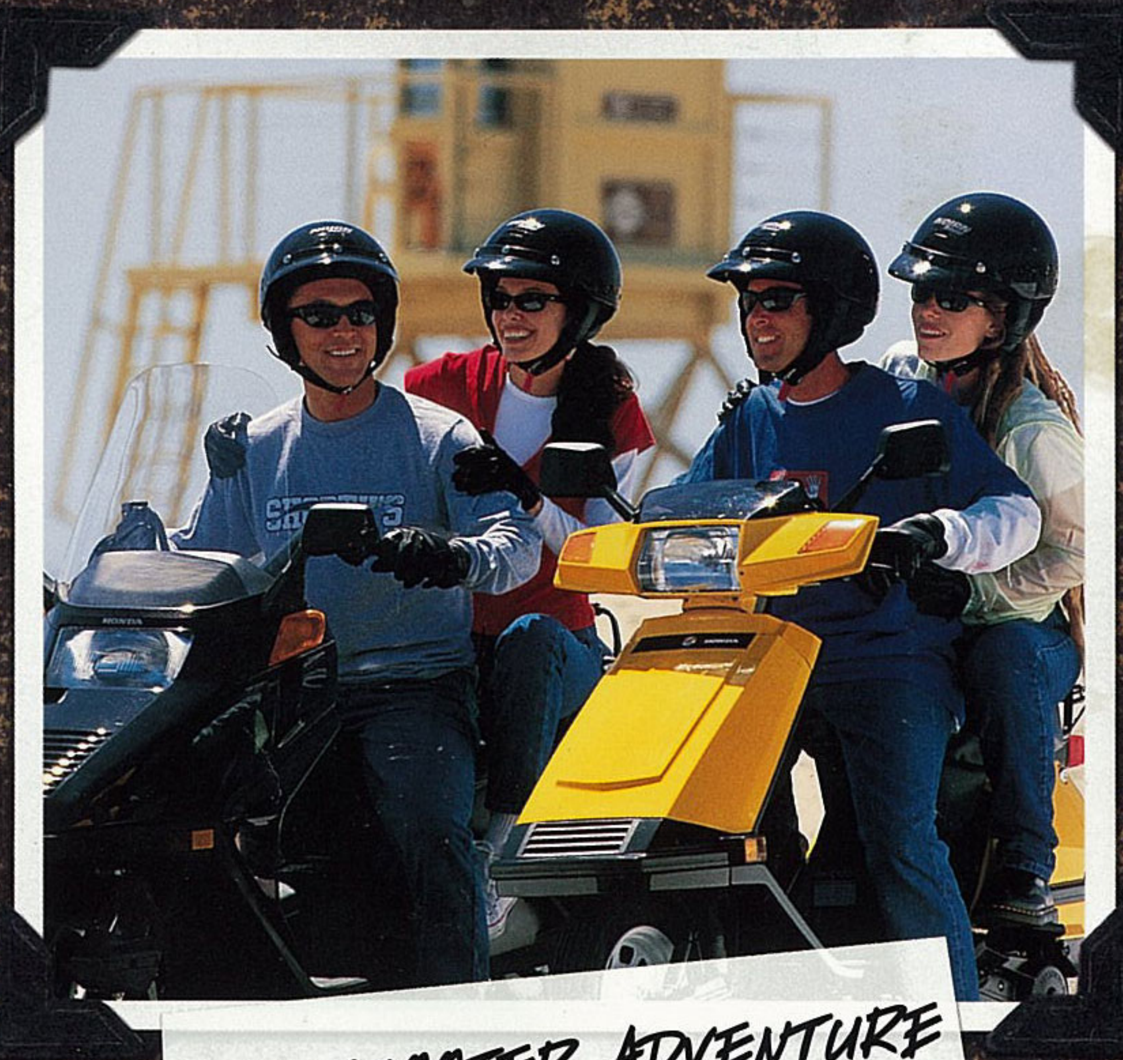
OUR SCOOTER ADVENTURE